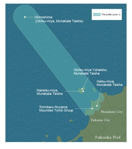
Fig 4. Buffer Zone of The Sacred Island of Okinoshima and Associated Sites in the Munakata Region