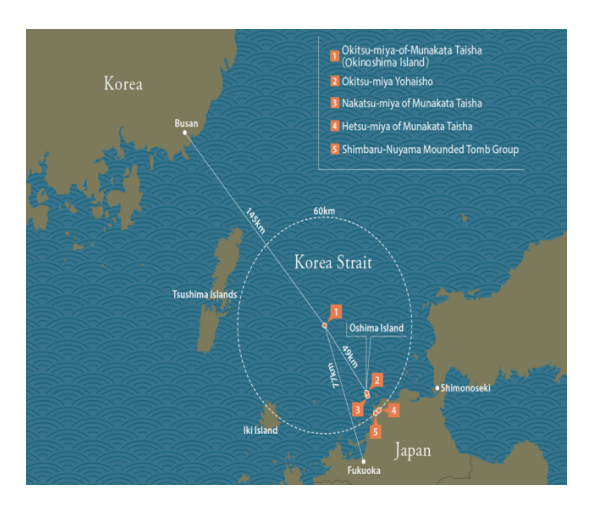
Fig 3. Location of The Sacred Island of Okinoshima and Associated Sites in the Munakata Region

'The Sacred Island of Okinoshima and Associated Sites in the Munakata Region' are in Kyushu area located southwest from the Japanese archipelago. 5 properties, which are located in Okinoshima Island and Oshima Island in Korea Strait and mainland in Fukuoka Prefecture adjacent to Korea Strait, are incribed on UNESCO's World Cultural Heritage List in July, 2017.<sup>2</sup>