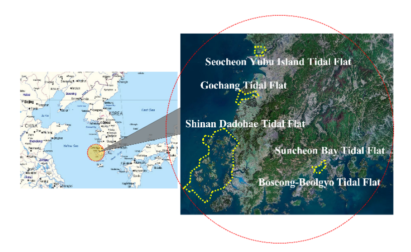
Fig 2. Location of The Southwestern Coast Tidal Flats

The Southwestern Coast Tidal Flats' are located in the southwestern part of Korean Peninsula. In the year of 2010 when 'The Southwestern Coast Tidal Flats' were inscribed on tentative list, they covered the tidal flats of Gochang-gun and Buan-gun, Jeollabuk-do, and Suncheon-si, Boseong-gun, Muan-gun, Shinan-gun, Jeollanam-do. After a few changing processes, tidal flats of Seocheon-gun, Chungcheongnam-do, Gochang-gun, Jeollabuk-do, and Suncheon-si, Boseong-gun, Shinan-gun, Jeollanam-do are sought to be inscribed on UNESCO's World Heritage List from 2015 on. The whole area of the tidal flats is about 59,000ha, and ShinanDadohae Tidal flat in Shinan-gun is about 45,000ha and it occupies 76.3% of the whole area.